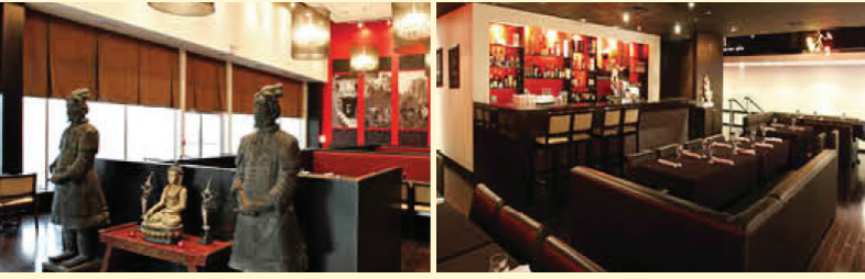
beautiful large dining room to accommodate groups of all sizes upper Lounge available for your next meeting or private event

vaughan mills [entrance gate 3] 1 bass pro mills drive, unit r2 vaughan, on l4k 5w4 call to reserve your table or book your private event 905.738.8398