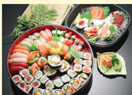
craft your own party tray available