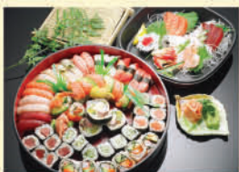
craft your own party tray available