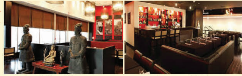
beautiful large dining room to accommodate groups of all sizes upper Lounge available for your next meeting or private event

vaughan mills [entrance gate 3] 1 bass pro mills drive, unit r2 vaughan, on l4k 5w4 call to reserve your table or book your private event 905.738.8398 for online order, promos and information, visit www.szechuanszechuan.com